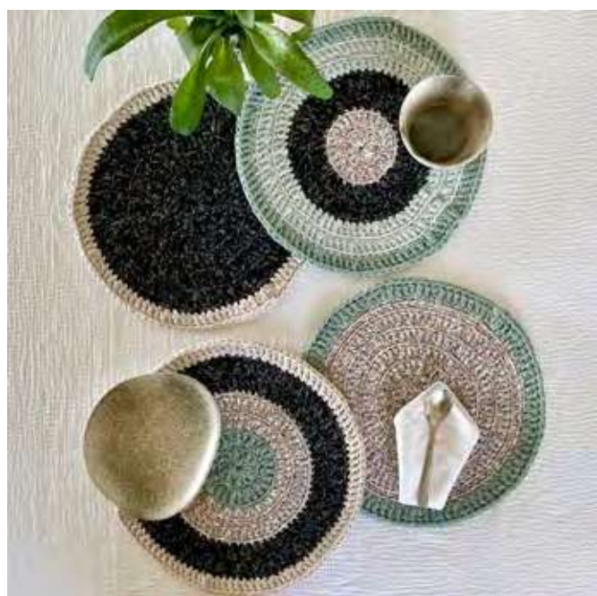
Set of 4 Round Crochet Placemats 14" Diameter