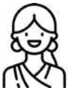
Handmade by Rural Women