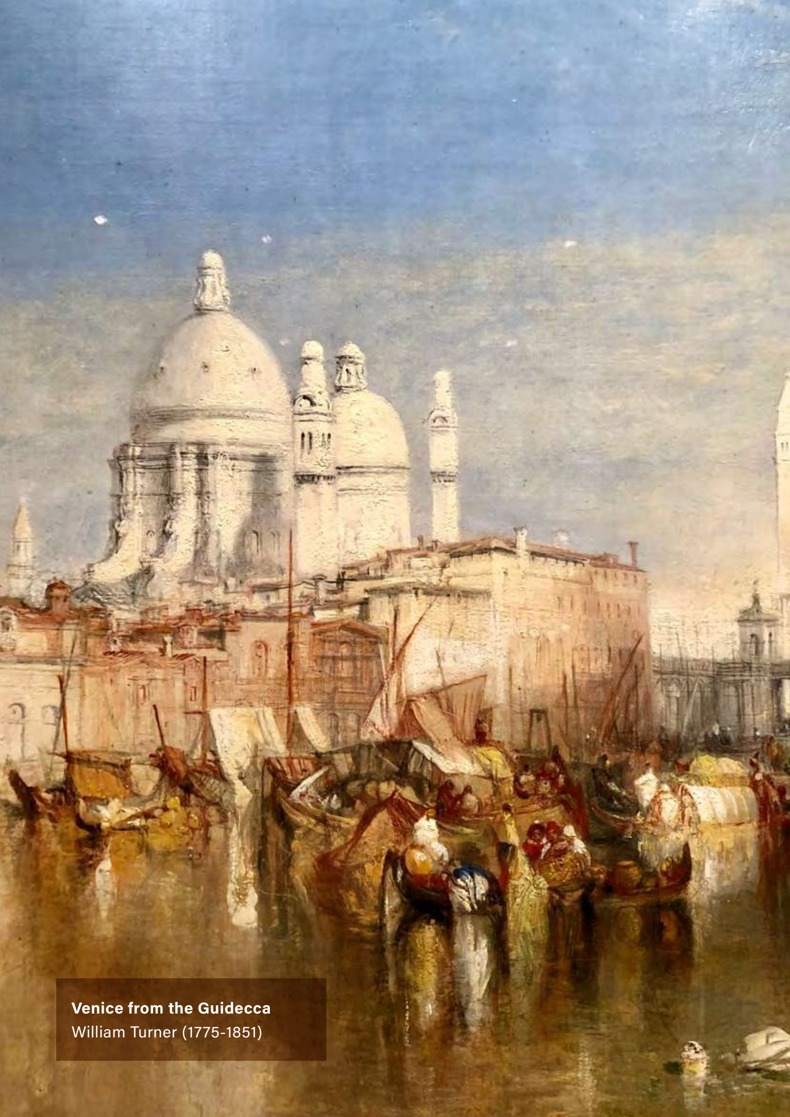
Venice from the Guidecca William Turner (1775-1851)