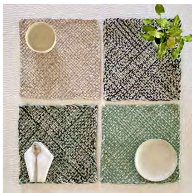
Set of 4 Placemats 14" Squares