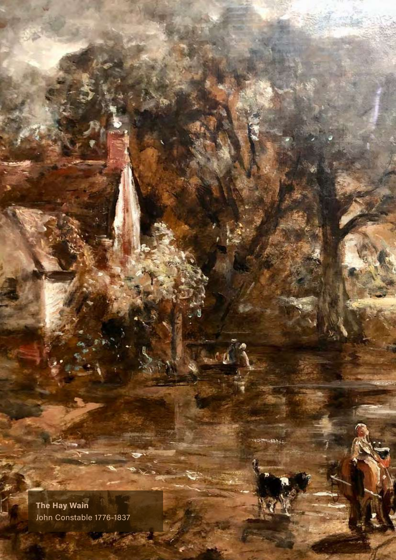
The Hay Wain