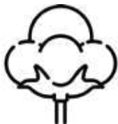
100% Cotton Hosiery Yarn