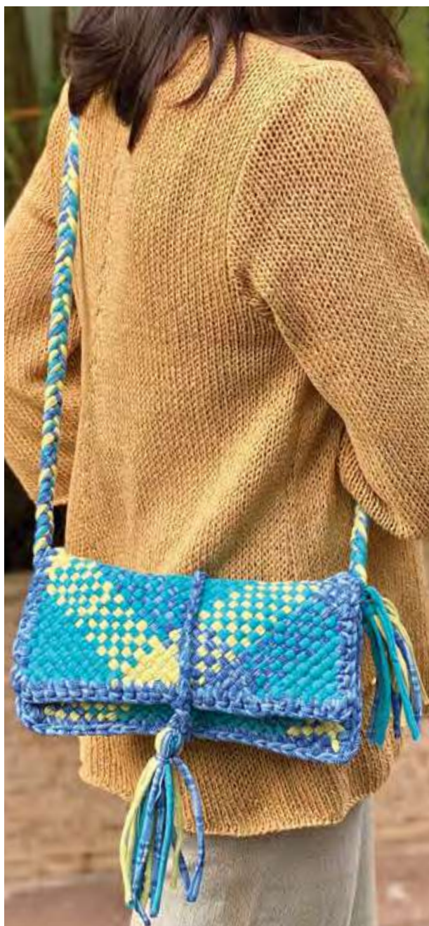
Cross body pouch sling 10" X 6" with 40" shoulder strap