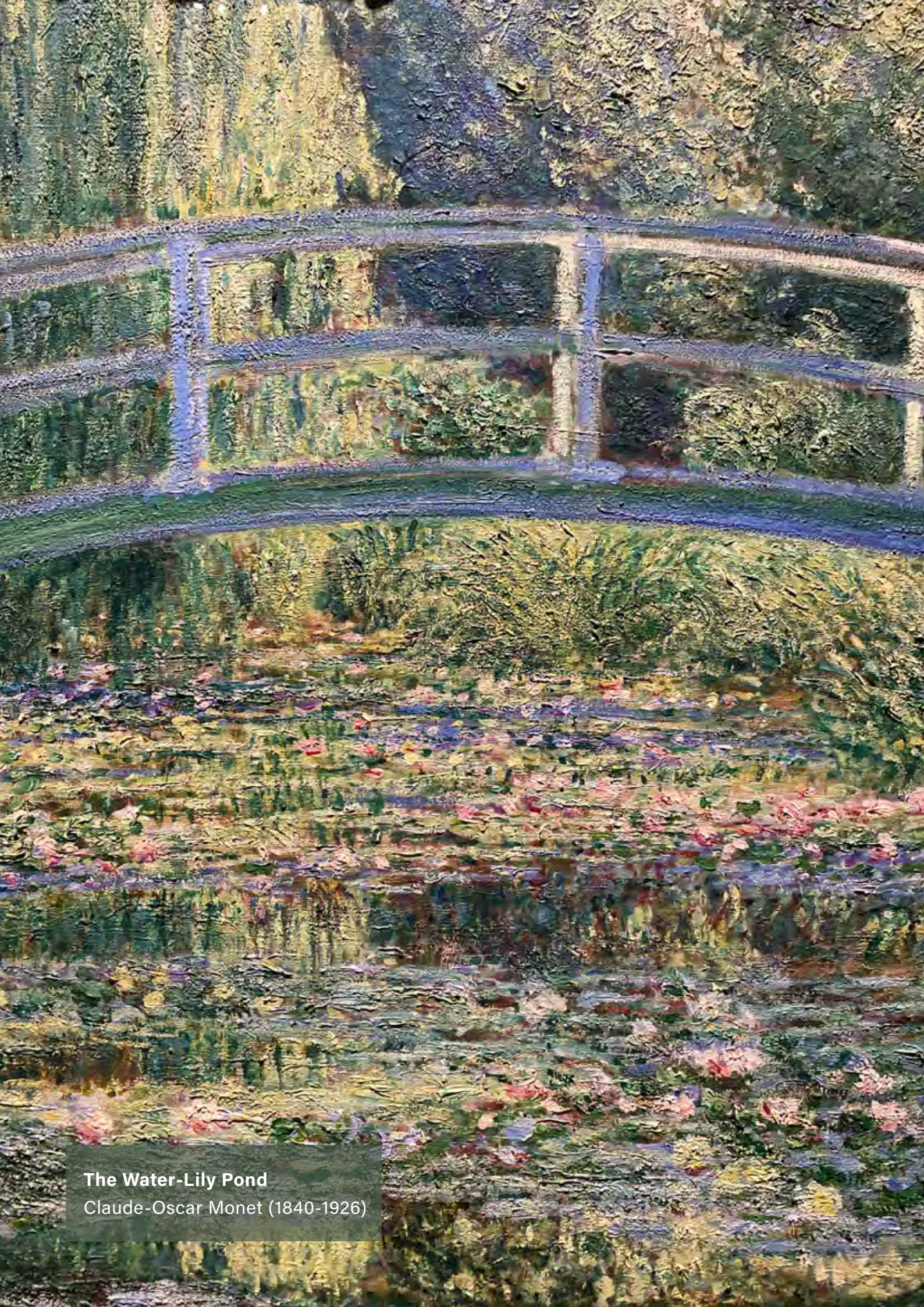
The Water-Lily Pond Claude-Oscar Monet (1840-1926)