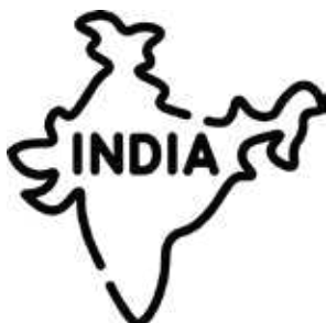
Made in India