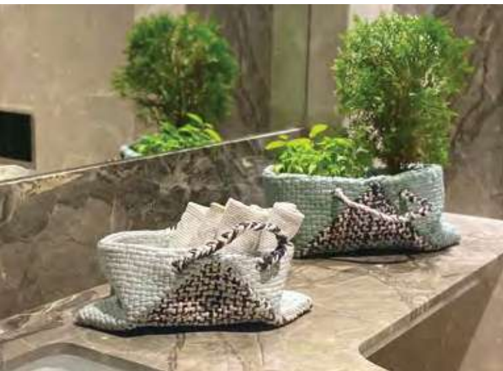
Light Teal Clutch Bag 13.5" X 6.5" Teal Clutch Bag 18" X 8.5"