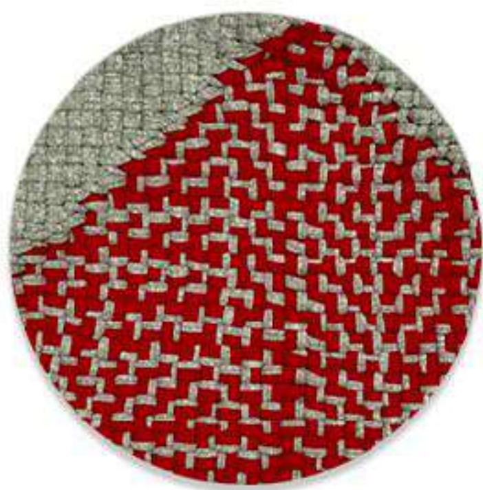
Intricate Woven Patterns