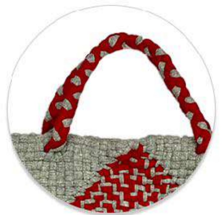
Sturdy Braided Handles